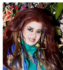
By: Shahnaz Husain

ing completely barefaced isn't an option either. So, what do you do?