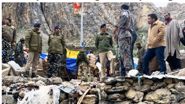
Agency Srinagar, July 09:

At least 16 people have died in the flash flood triggered by a cloudburst in Jammu and Kashmir's Ganderbal district, news agency ANI reported Saturday. The victims were camping near the Amarnath cave shrine, when the cloudburst occurred around 6 pm Friday. The flash flood washed away a part of the camp.